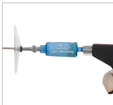
6 Hygiene filter for water flushing