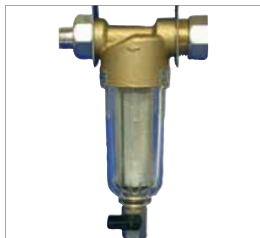
2 Water prefilter for ENT units