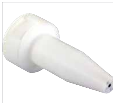
3 Rinsing connection for thermic stimulation