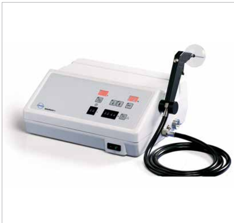
1 ATMOS® Variotherm plus