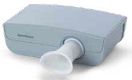
Ultrasound spirometer SpiroScout SP plus